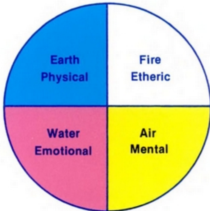
Figure 4 The Four Elements Corresponding to the Four Lower Bodies and the Four Planes of Matter